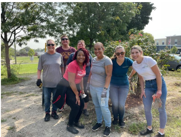
Community Shelter Board Volunteer Group- September 16. Meditation Garden Clean Up

Check out some of the amazing volunteer groups that have joined us at the Van Buren Center in the month of September. Volunteers are essential to the work we do and without the countless individuals who give their time, talent, and heart each day we would not be able to make the incredible impact we do in our community.