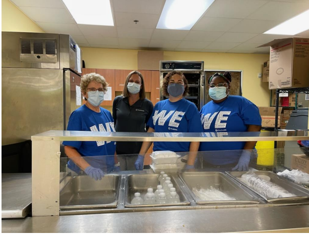
Ohio Health Volunteer Group- September 20. Lunch Service