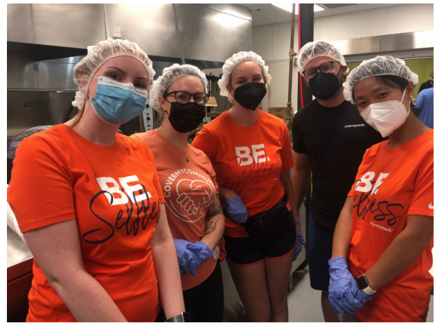
CoverMyMeds/Besa Volunteer Group- August 31. Dinner Service