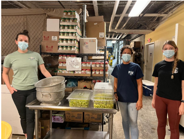
Amazon Fulfillment Center Volunteer Group- September 14. Kitchen Prep