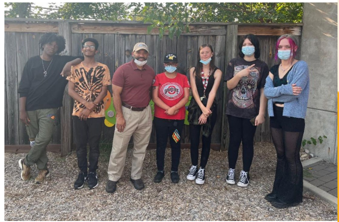
Franklinton High School Student Volunteer Group- Month of September Kids Programming